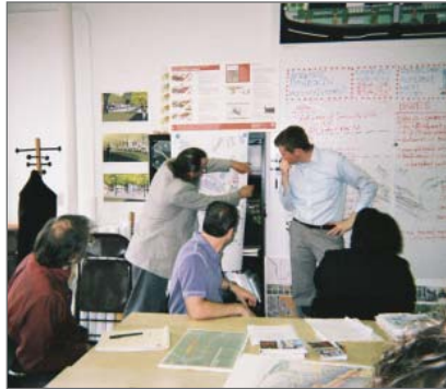
A business owner describes his parking situation during a Shared Parking workshop for the Raymond Station Area

U-PLAN offers a variety of design services to help stakeholders envision and create special places that are reflective of the unique character of the community; emphasizing transit-oriented design and sustainable development. Organized “charrettes” bring community residents and businesses together with design professionals to create state-of-the-art architectural renderings, perspectives, and presentation materials. U-PLAN can also assist in the site planning process, including site analysis, code research, and concept planning.